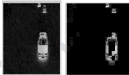
Fig 3 detection of moving Object