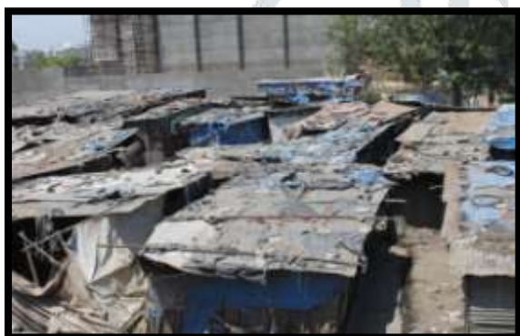
Figure 5 - Huts