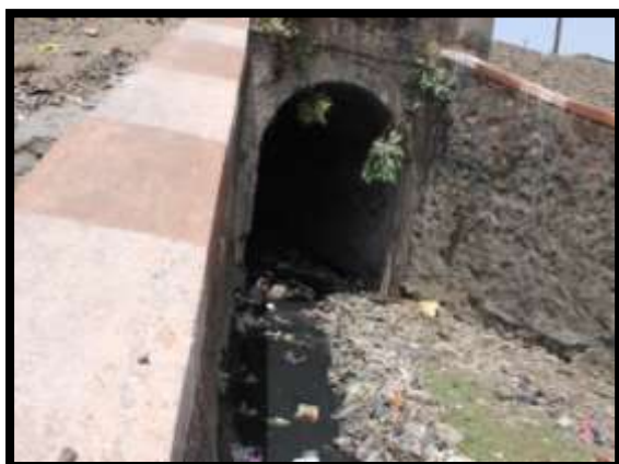
Figure 3 – Opened Urinals