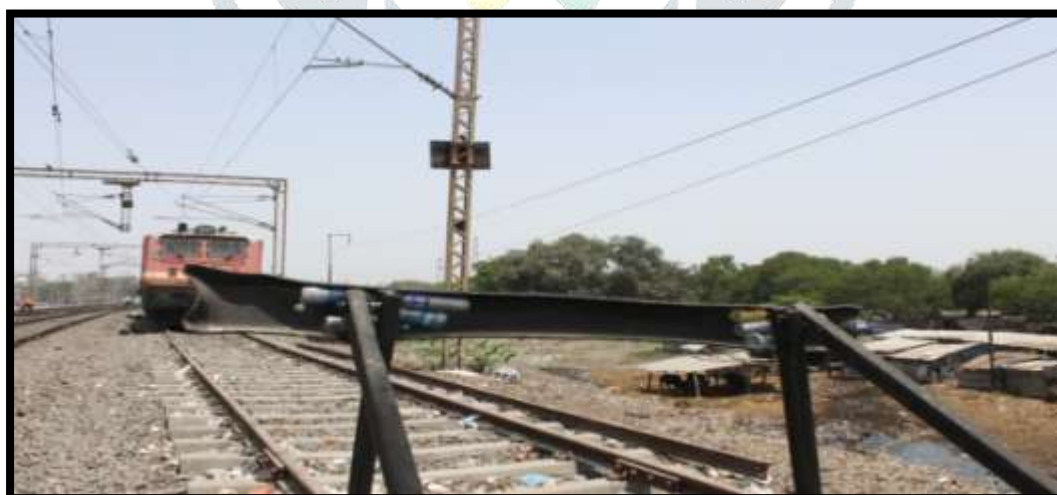
Figure 7– Damage to Government Property