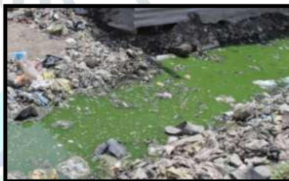
Figure 6 – Waste Water