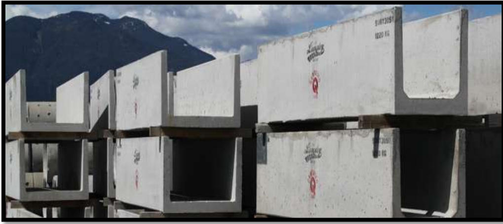
Figure 9– Proposed Drainage Channel