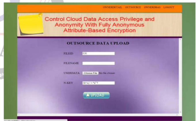
Fig 3. Database upload