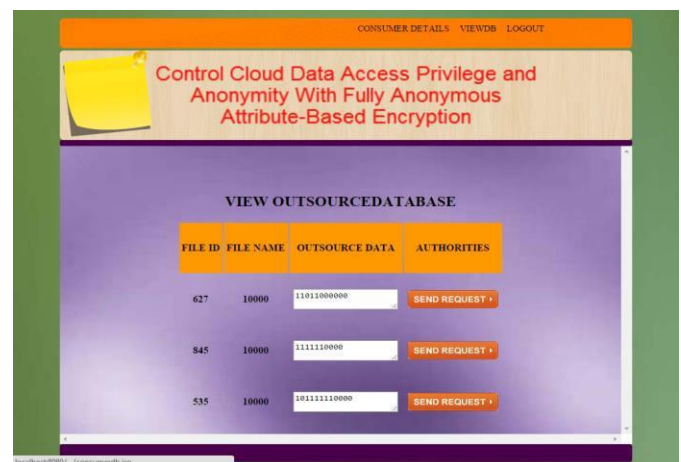
Fig 4. Consumer database

Various techniques have been proposed to protect the data contents privacy via access control.