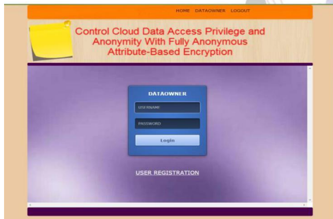
Fig 1. Login form

Fine-Grain concept using encrypted data convert into binary value fully secure for database.