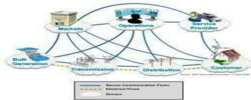
Figure 1: Smart Grid