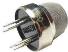
Fig. 2 MQ-5 Gas sensor

For the Configuration of MQ5., sensor composed by micro \text{Al}_2\text{O}_3 ceramic tube, Tin Dioxide ( \text{SnO}_2 ) sensitive layer, measuring electrode and heater are fixed into a crust made by plastic and stainless steel net. The heater provides necessary work conditions for work of sensitive components. The enveloped MQ-5 have 6 pin ,4 of them are used to fetch signals, and other 2 are used for providing heating current.