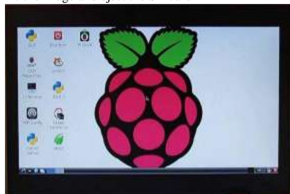
Fig 4:Installed Raspbian OS