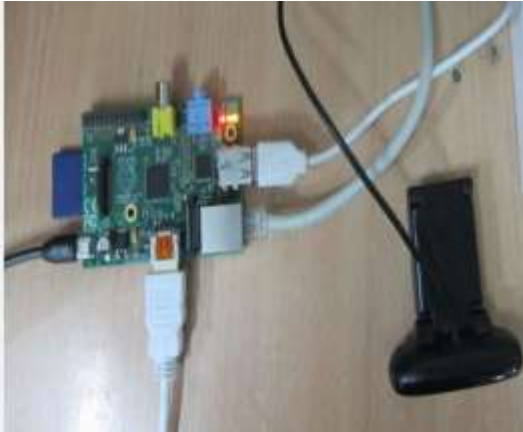
Fig 2: Connection Of USB Camera With Raspberry Pi

Putty configuration and VNC viewer are needed to install Raspbian OS . Putty configuration is SSH and Telnet client .It is a open source software that is available with source code. Virtual network computing is a Graphical desktop sharing system that allows us to remotely control the desktop interface of one computer from another.