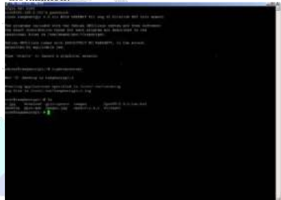
Fig 3:PuTTY configuration