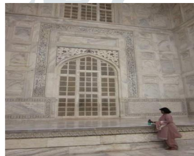
Figure 3 Inside and outside view of Taj Mahal Jali