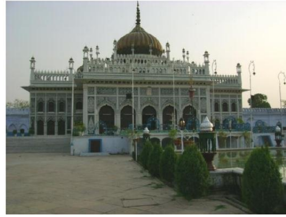
Figure 1 Water body in front of Taj Mahal and Chota Immambada, Lucknow