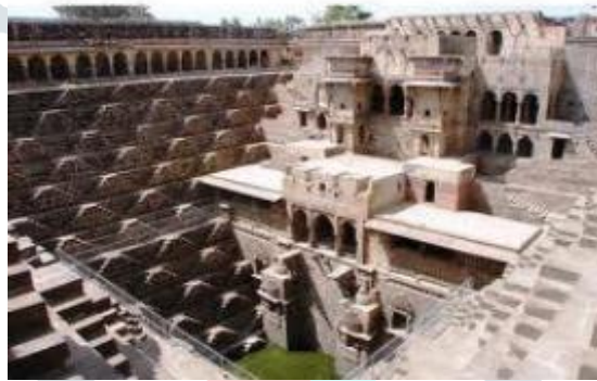
Figure 2 Chand Baoli – Step well in Jaipur

This method was employed over 1,500 years ago by local Rajasthanis, who built "baoli" or stepwells -- bodies of water surrounded by a descending set of steps, helping to create a microclimate in the surrounding structure. Chand Baoli is a famous step-well situated in the village of Abhaneri near Jaipur. It was built in the 9th century and has 3500 narrow steps in 13 stories and is 100 feet deep (Figure 2).