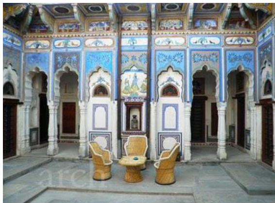
Figure 5 Haveli of Shekhawati Rajasthan

Courtyard was also an important design element in old residential buildings in hot dry climate including palaces. It was an element of passive cooling for regular fresh air supply and for day lighting. These interior courts - a common feature of Rajasthan architecture - optimize circulation of air during the 50°C summers (Figure 5). The rooms around courtyard are comfortable for use.