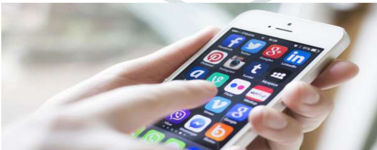
Fig.1 Social media can be accessed via smart phones and other portable devices within lectures, seminars and tutorials.