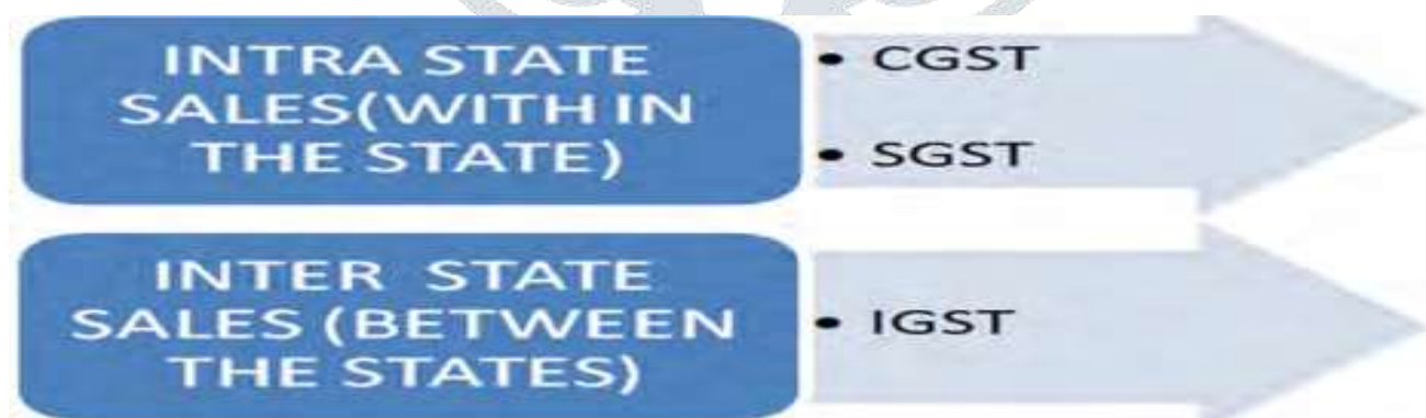
Figure 1. Framework of Dual system of GST in India 2017.