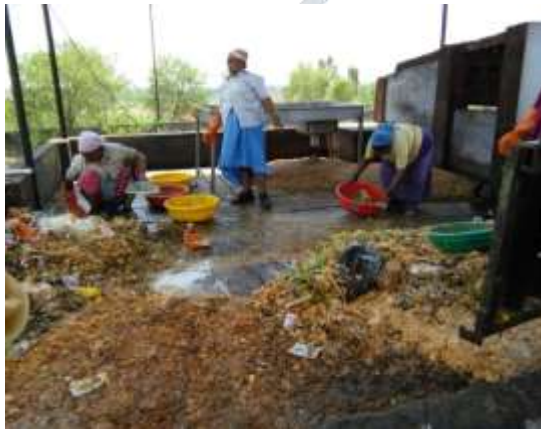
Figure: Segregation of Food waste

The Kagal municipality has succeeded in generating electricity from food waste by generating methane gas. Major the street lights are LED bulbs that run on electricity generated from good waste.