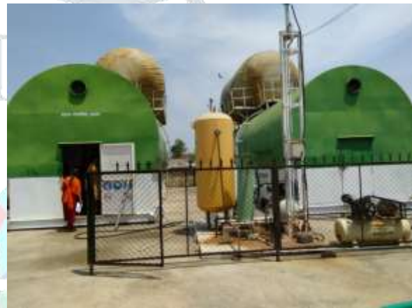
Figure: Green Box (Energy generation plant)