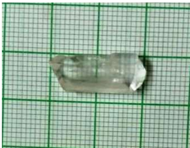
Figure 2: Grown crystal of LH2NB(I) from methanol