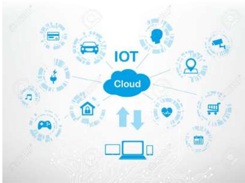
Fig 2. Cloud of Things