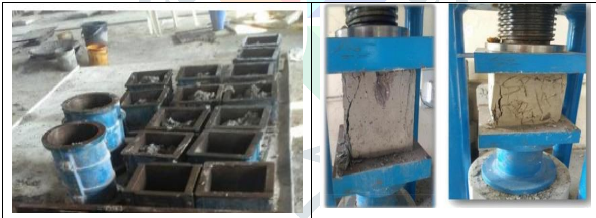
Figure1 (a) Casting of Concrete Cubes