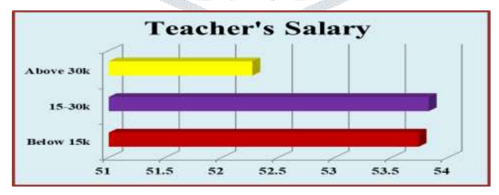
Figure-3: Mean values of Teacher's Salary Details

From table 8, it is evident that the obtained p value 0.612 was greater than the significant level (p>0.05). The value also confirms that there was no significant difference between the teacher's salary on 15k, 15-30k and above 30k in relation to attitude.