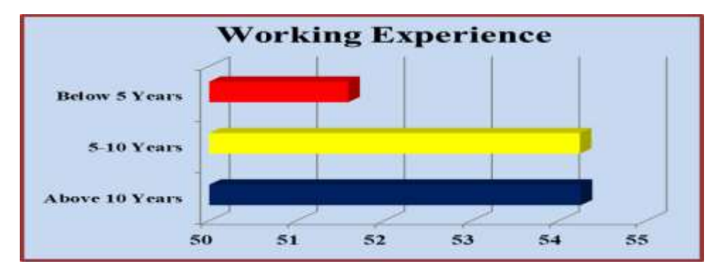
Figure-2: Mean values of Teacher's working Experience