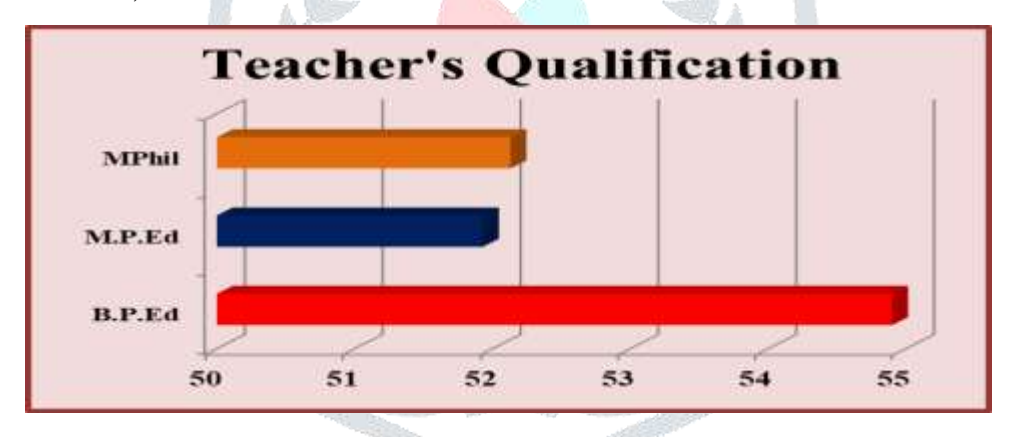
Figure-4: Mean values of Teacher's Qualification

From table 10, it is evident that the obtained p value 0.157 was greater than the significant level (p>0.05). The value also confirms that there was no significant difference between the teacher's qualification as B.P.Ed, M.P.Ed and MPhil in relation to attitude.