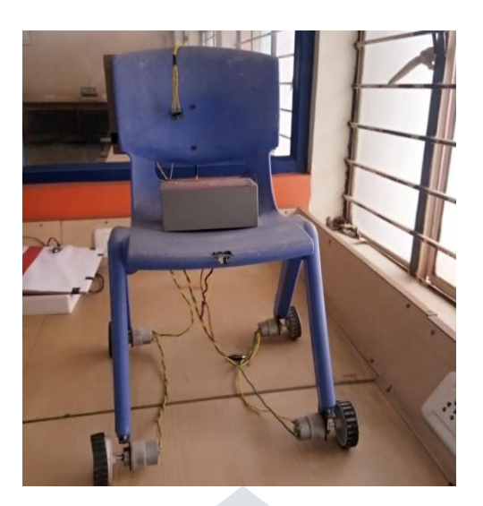
Fig(a): working model