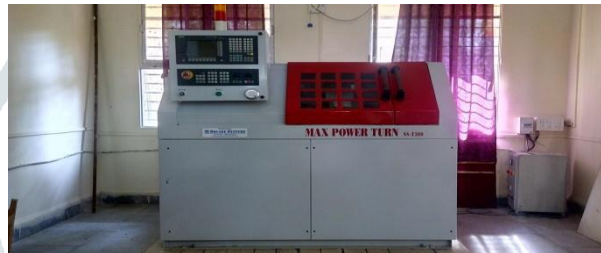
Figure.5.1 CNC Turning Lathe Machine

The turning operation is carried out on the CNC Lathe machine for the better accuracy of Result. single point cutting tool. Inserts of Sandvik GC4035 (HC) – P35 (P20 — P45) CVD-coated carbide grade for roughing and finishing of steel and steel castings under unfavourable conditions are used.