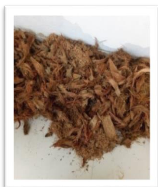
1) Sundried Husk