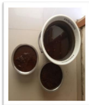
3) Washing of Cocopeat