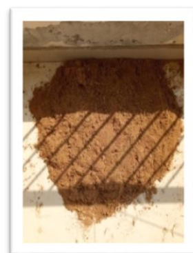
4) Dried Cocopeat

Preparation of cocopeat biofilter unit- The biofilter was constructed in a cylindrical shaped plastic bottle having radius 0.05m and height 0.3m. The bottom layer was filled with 2cm gravel which acts as a supporting media and middle layer was filled with cocopeat and upper layer with coco-coir (fiber) which was about 6cm. Coco-coir prevents spreading of bad smell as well as helps in even distribution of wastewater effluent. The area of constructed biofilter was 1099\text{cm}^2 or 0.1099\text{m}^2 . The filtered water was collected in a beaker and dosing of wastewater was done intermittently in batch. The photograph of experimental set up in laboratory is shown below.