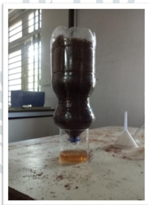
5) Cocopeat Biofilter Unit

Preparation of cocopeat biofilter unit- The biofilter was constructed in a cylindrical shaped plastic bottle having radius 0.05m and height 0.3m. The bottom layer was filled with 2cm gravel which acts as a supporting media and middle layer was filled with cocopeat and upper layer with coco-coir (fiber) which was about 6cm. Coco-coir prevents spreading of bad smell as well as helps in even distribution of wastewater effluent. The area of constructed biofilter was 1099\text{cm}^2 or 0.1099\text{m}^2 . The filtered water was collected in a beaker and dosing of wastewater was done intermittently in batch. The photograph of experimental set up in laboratory is shown below.