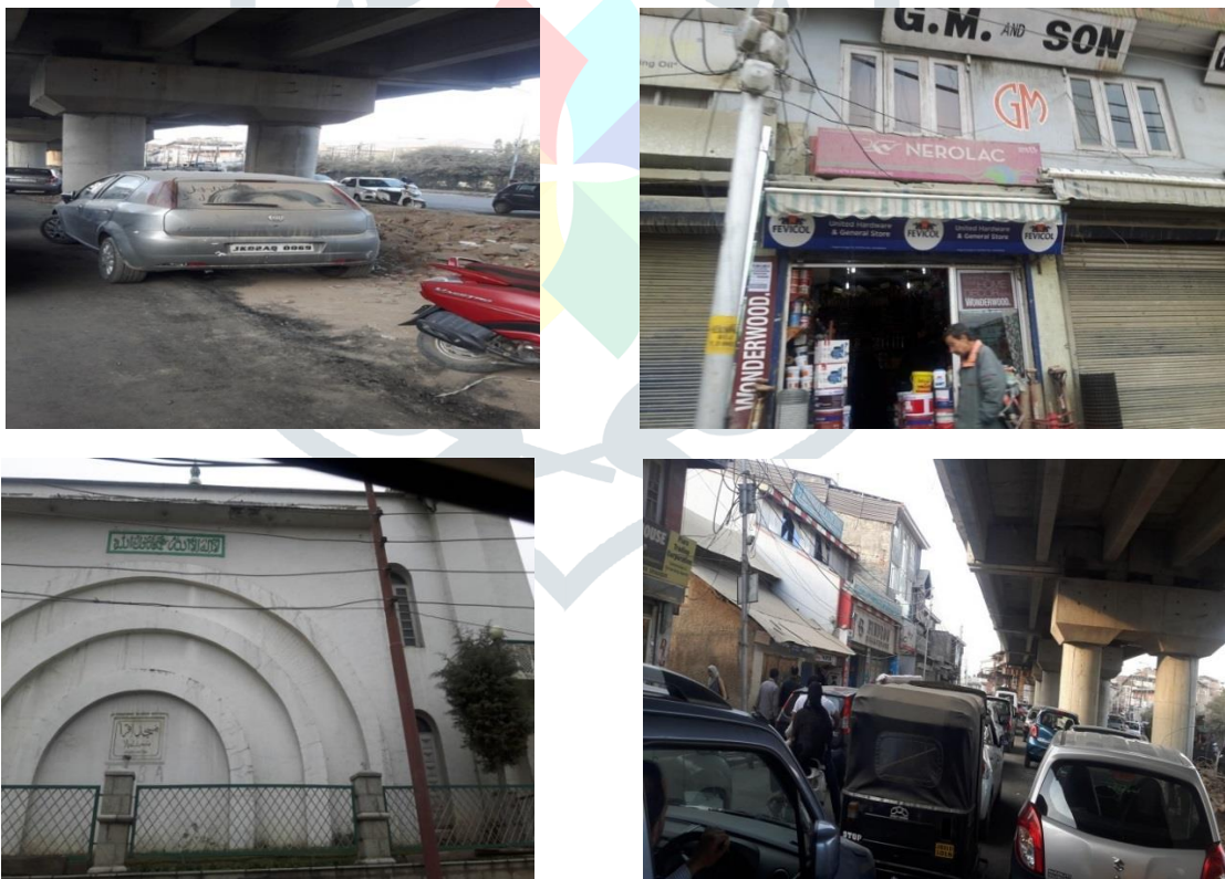
Slide-1a: layer of dust particles settled on vehicles, shops, a mosque and traffic congestion along the whole stretch of flyover.