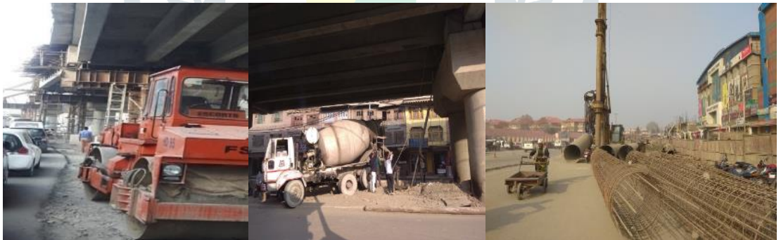
Slide-3: Heavy machinery on the site is the main cause of elevated noise level.