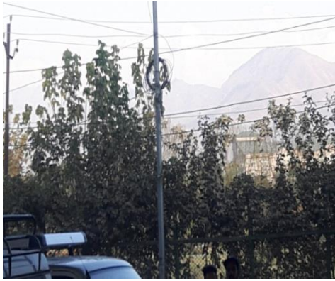
Slide-1b: Dust laden vegetation near project site.