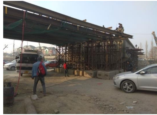
Slide-1c: Daily routine activities during construction phase posing threat to common people.