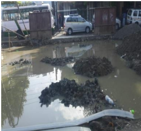
Slide -2: Mud pools due to collected rain and water used in construction.