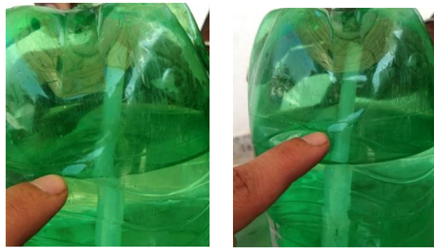
Fig 3. Before and after supply of hydrogen during downward water displacement.