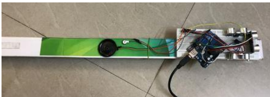
Fig. 3. Hardware Configuration

This piezoelectric vibrator will provide the different vibration so user would be able to move in particular directions as per different patterns.