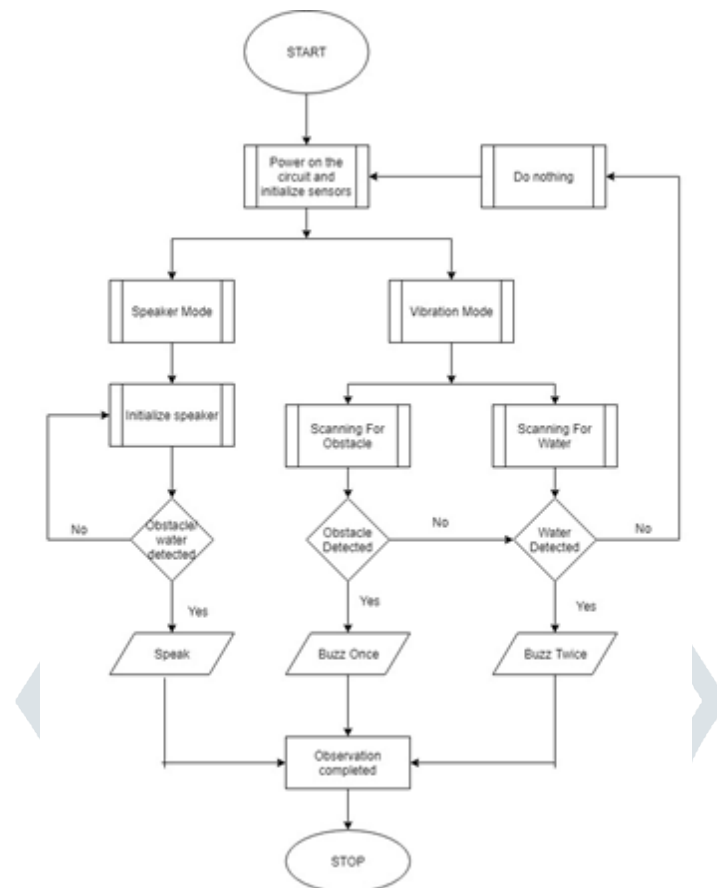
Fig. 1. proposed system flowchart