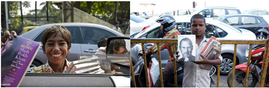
Fig-1 Children selling books