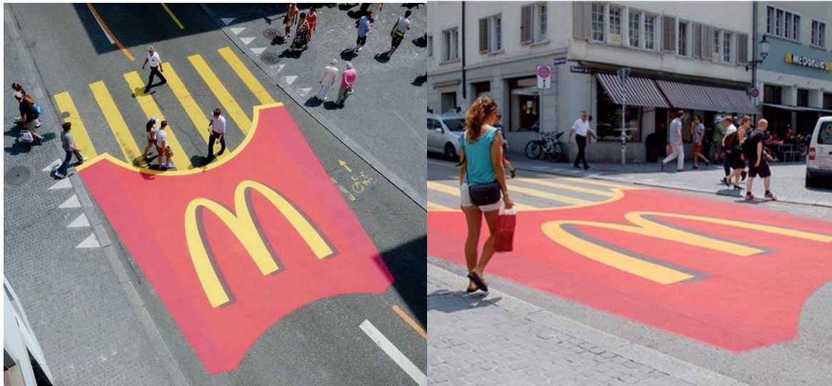
Fig-6 McDonalds Crosswalk (TBWA, 2010)

In 2010 MacDonald's did an add series which utilised crosswalk designed to look like French fries and the fries acting as a stripe on the cross walk. The cross walk led right onto a MacDonald restaurant. It served to remind hungry pedestrians crossing the streets that the food was few steps away. (TBWA, 2010)