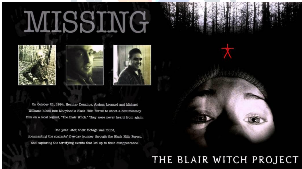
Fig-5 ‘The Blair witch project’ web page (Kring-Schreifels, 2019)

The clever students set up a website to help them spread the Blair witch legend’s news-and people literally bought it. Due to the mystery and awe surrounding the legend, the news spread like wild fire and it was stated that it was a real story movie. This buzz helped in making the movie a box office hit. (Kring-Schreifels, 2019)