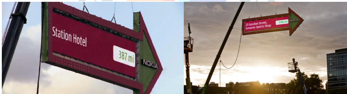
Fig-2 Nokia GPS Signboard

Nokia created the world's largest interactive signpost in London with the aim of raising awareness of Nokia GPS (global positioning system). With this marketing effort, the consumer can type in recommendation anywhere in the world for their choice of local attraction. The destination was displayed on the huge sign with full data about the destination and distance in kilometres to the designated place after submission. In London and the neighbouring market, this stunt helped create a monstrous effect. Illustrating the use of social media as well as the consumer's ability to generate a lifetime experience from the brand. This also created general awareness regarding how it is like to own Nokia GPS. (SEVERN, 2012)