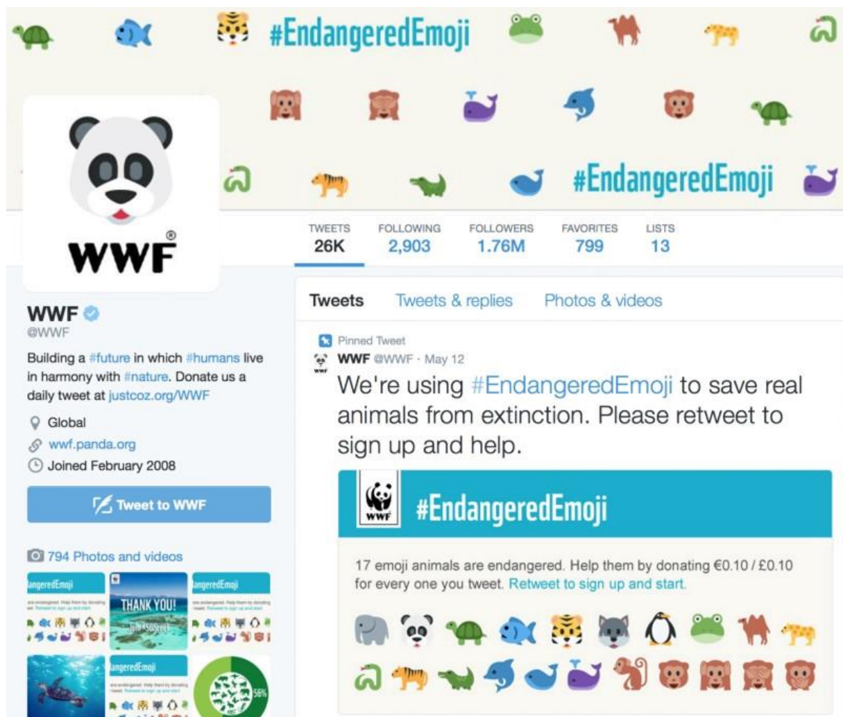
Fig-3 WWF Animal Emojis (WWF, 2015)