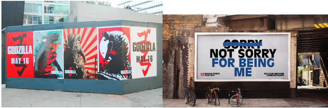
Fig-4 Wild Posting Billboards