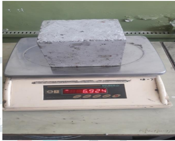
Fig.4(a) fully coarse aggregate concrete cube