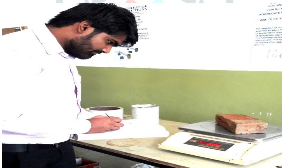
Fig 3- to find water absorption of brick

The water absorption take a look at was administrated for each OVB and GA in accordance with IS 2386 (Part3) – 1963. The water absorption of mixture is decided by measurement the rise in mass of AN oven-dried sample once immersed in water for twenty-four hours. The magnitude relation of the rise in mass to the mass of the dry sample, expressed as a share, is termed as absorption7. The water absorption results were shown in Table.2. The water absorption in OVB was found to be 5.47%. This worth was abundant beyond that of GA, of that absorption was solely zero.25%. the upper water absorption was owing to the presence of a lot of pores in OVB.