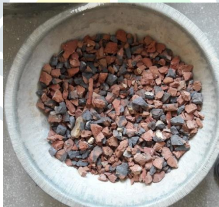
Fig 1- sample of over burn brick aggregate

Raw materials that are used in this analysis were normal Portland cement, granite as coarse aggregate, waste over burn brick and fine combination. different vital materials were organic foaming agent and suitable water content. during this study, a complete of fifty concrete cubes with dimension 150 mm x 150 mm x 150mm are created. All samples were created victimisation customary steel molds and were clean to avoid any impurities hooked up to concrete mixtures. One set of concrete specimens were additionally been created as controls. After traditional commixture of between granite, waste over burn brick, cement, sand and water, foamed were injected into the cement mixer throughout commixture method. The volumes of foamed required during this study made up our minds based mostly from targeted density at day 28. Foames area unit made of a combination of water and natural organic chemical compound. Functions of those bubbles area unit to assist entrapped air into the mixture and consummated the area. The samples are tested for 7, 14 and 28 days severally.