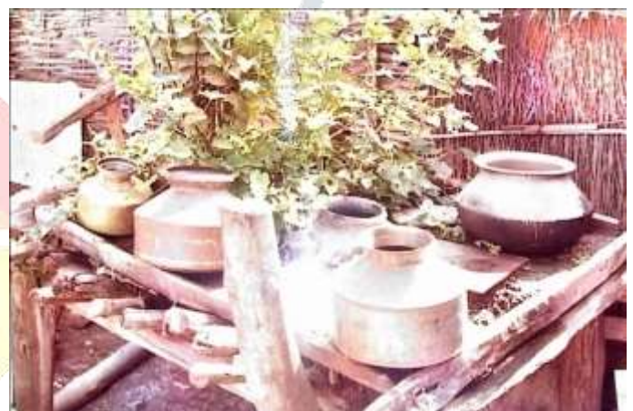
Earthen pots with water, kept on teak wood frame, Which is filled with soil for cooling purpose.