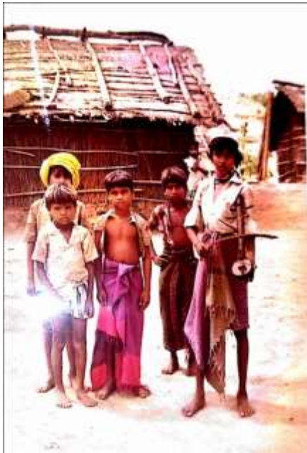
Common musical instruments of Dhanake tribe