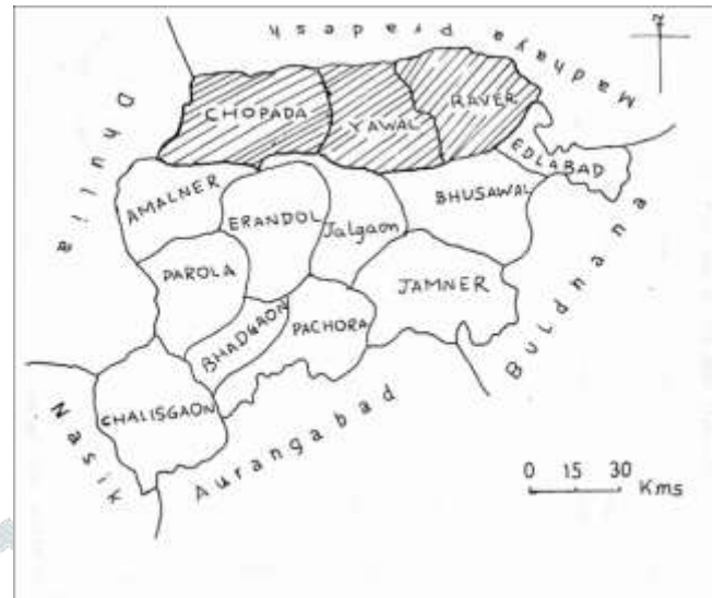
Map of Jalgaon District