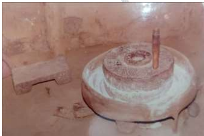
'Jatya' (Grinding device) mounted on wooden disc made by Teak wood.