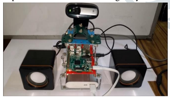
Fig 1.2: Working module of System.

In case remote access of device, user can get every device's status through cloud stored its status, and form remote location also user can control home appliances. In case of emergency situation for older immediate notification to their beloved once, hospitals can be send through phone call or email. Health module, Calendar module, Automation and manual module is developed for easy user experience and smooth working of system.