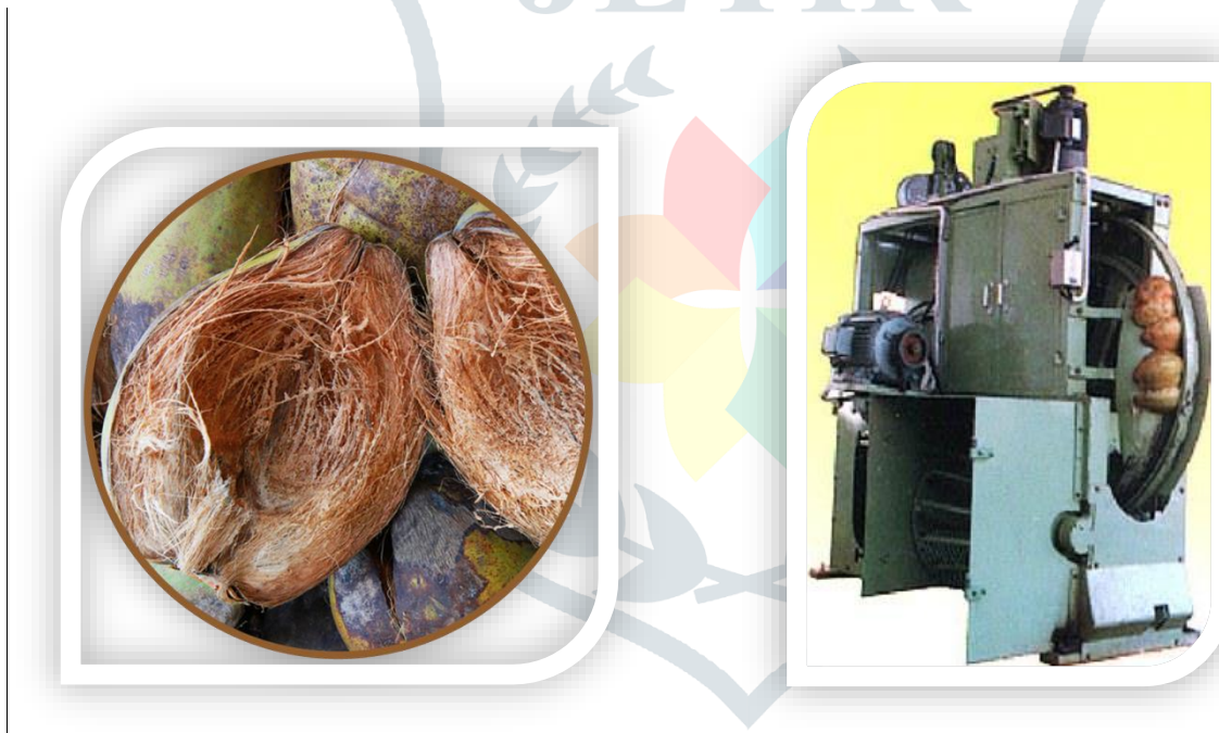
Figure:- 1 Husk of Cocos Nucifera

This is a mechanical processes using either de-fibering or decorticating equipment process the husks after only five days of immersion in water tanks. Crushing the husk in a breaker opens the fibers. By using revolving drums the coarse long fibers are separated from the short woody parts and the pith. The stronger fibers are washed, cleaned, dried, hackled and combed.