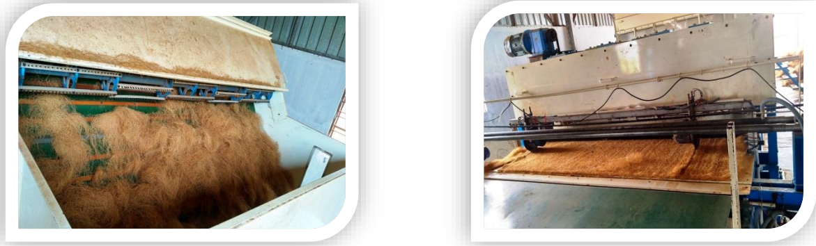
Figure :- 3 Mulch Sheet Formation Machine