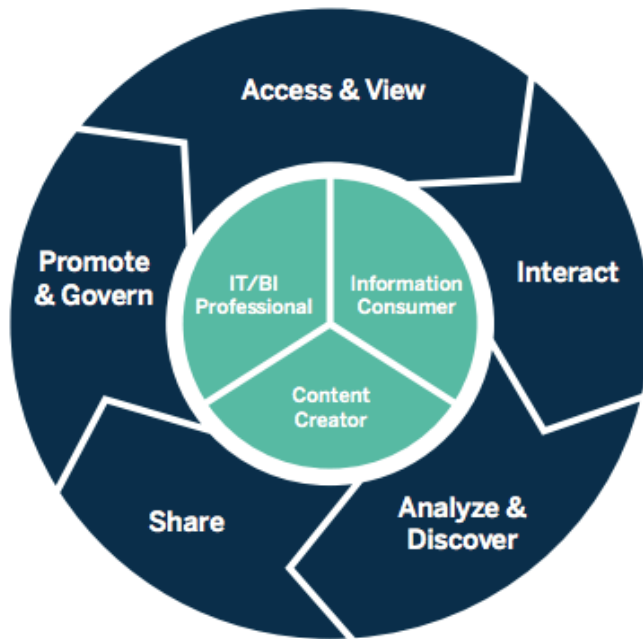
Fig 3 : The Modern Analytics workflow