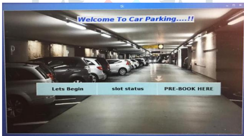
Fig 2: Web Application Overview