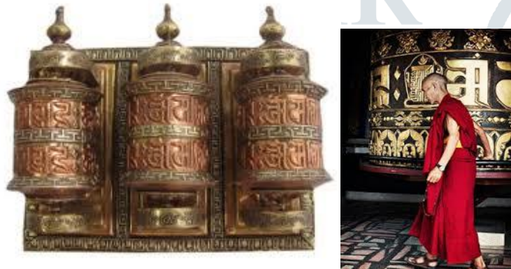
Chart -1: Prayer wheel

“Tibetan prayer wheels (called Mani wheels by the Tibetans) are devices for spreading religious blessings, and well-being. Rolls of skinny paper, imprinted with several copies of the mantra (prayer) Om Mani Padme Hum, written in ancient Indian script or in Tibetan script, square measure wound is around the shaft in an exceedingly protecting instrumentation, and spun around and around. Typically, larger ornamental versions of the symbols of the mantra are sculpted on the surface cowl of the wheel. Tibetan Buddhists believe that speech this mantra, aloud or wordlessly to oneself, invokes the powerful benevolent attention and blessings of Chenrezig, the embodiment of compassion. Viewing a written copy of the mantra is claimed to possess a similar impact — and therefore, the mantra is sculpted into stones left in piles close to methods wherever travelers can see them. Spinning the written style of the mantra around in an exceedingly Mani wheel is additionally imagined having a similar effect; the additional copies of the mantra, the additional the profit.” Hindu deity Haven.