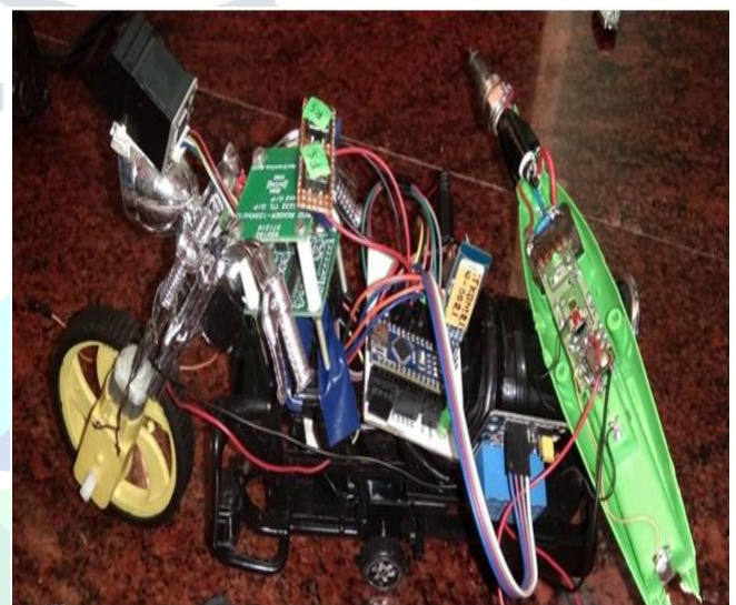
Fig.7 practical prototype model

A servo motor has a built in motor, a feedback circuit, and most important, a motor driver. Servo motors are used to control the position of objects, rotate objects, move legs, arms or hands of robots, move sensors etc. with high precision. Servo motors are small in size, and because they have built-in circuitry to control their movement, they can be connected directly to an Arduino