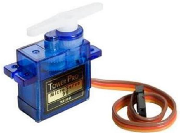
Fig.6 Servo Motor