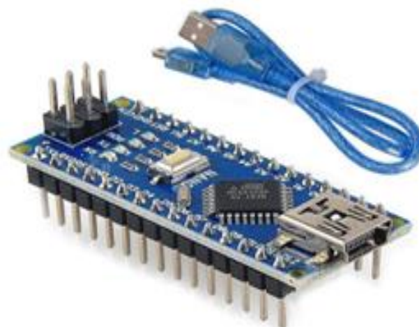
Fig.2 Arduino Nano Board

In the proposed system, the security is advanced by incorporating Fingerprint and RFID. Initially the user needs to confirm his/her identification before accessing the vehicle. For user identification finger print sensor and RFID is used. In recognition of the fingerprint and RFID, ignition will be given to start the bike and bike will be getting into the motion. In case of wrong access owner will get message with location. And owner can give access or stop the bike by locking brakes if it is motion.