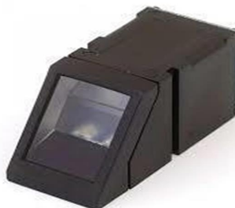
Fig.3 Finger Print Sensor

This is R307 Optical Fingerprint Reader Sensor Module. R307 fingerprint module is fingerprint sensor with TTL UART interface for direct connections to microcontroller UART or to PC through MAX232 / USB-Serial adapter. The user can store the fingerprint data in the module and can configure it in 1:1 or 1: N mode for identifying the person.