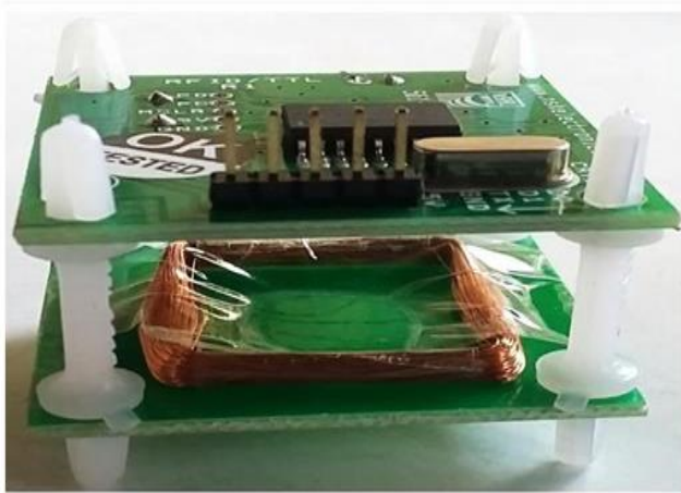
Fig.4 RFID Board