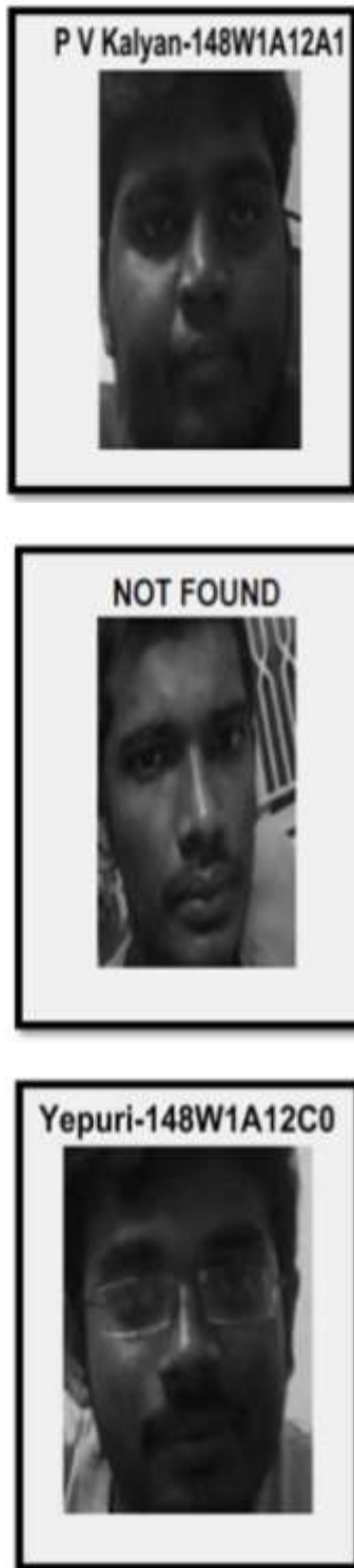
Figure 3.2 Output for the image in Figure 3.1

The input image Figure 3.1 now undergoes the predict process and the name of each person are given as in Figure 3.2.