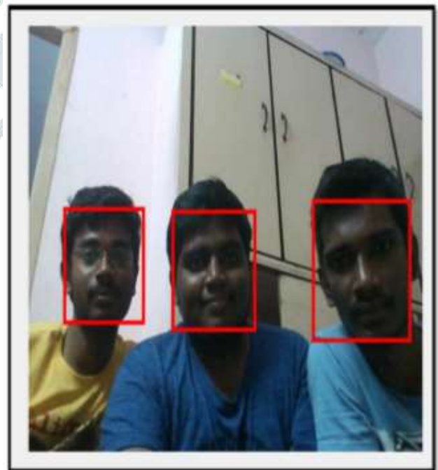
Figure 3.1: Input Image

After this the data is stored in the database. Now let us capture a picture from the webcam and see the results. The camera starts and takes the image to give the results checking from the saved database.