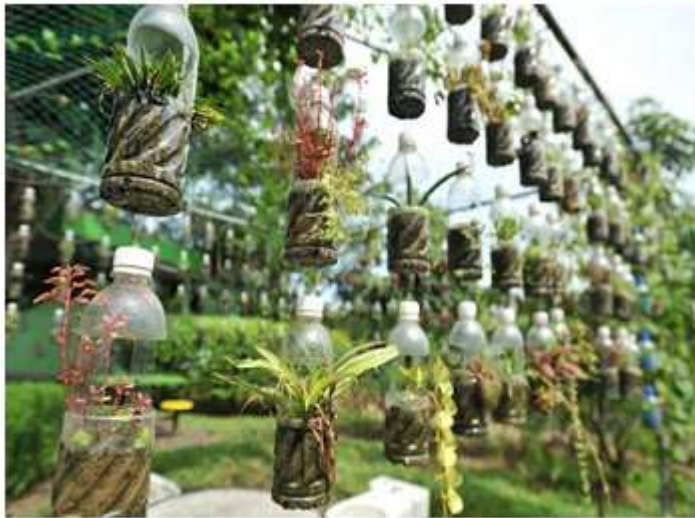
Figure 9 Plastic bottles hanging on net.