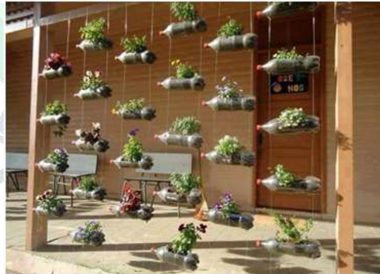
Figure 11 Hanging soda bottle garden.