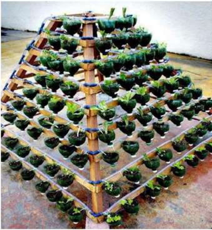
Figure 12 Pyramid plastic bottle garden.