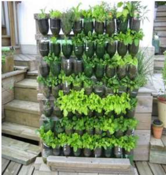
Figure 5 Half plastic bottle vertical garden on wooden frame.