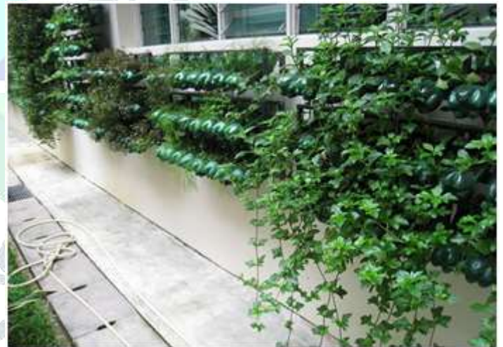
Figure 7 Another vertical garden.