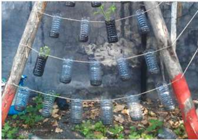
Figure 8 Bottles hanging on string.