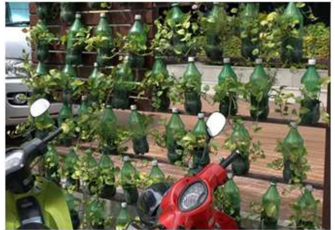
Figure 6 Here's another idea to create a vertical garden using the plastic bottles.