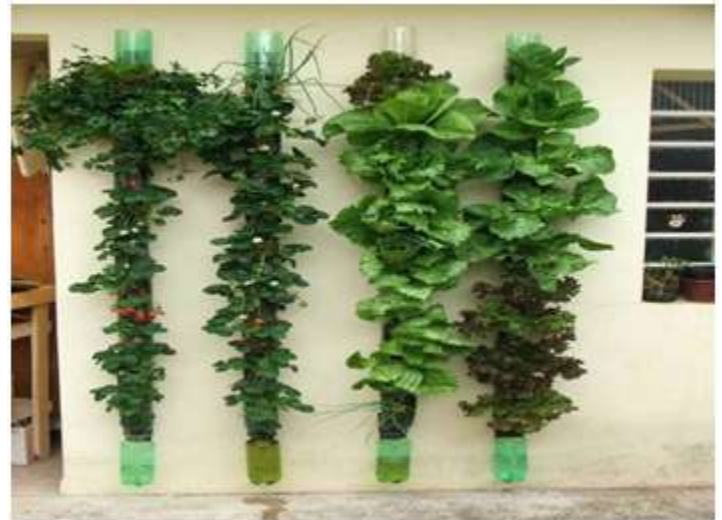
Figure 10 Inspiring plastic bottle garden.