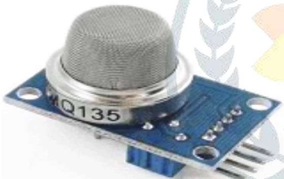
Fig. 7: MQ 135 Sensor

The MQ 135 Air Quality Detector Sensor Module for Arduino has lower conductivity in clean air. When the target combustible gas exists, the conductivity of the sensor is higher along with the gas concentration rising. Convert change of conductivity to the corresponding output signal of gas concentration. The MQ135 gas sensor has high sensitivity to Ammonia, Sulphide and Benzene steam, also sensitive to smoke and other harmful gases. It is with low cost and suitable for different applications such as harmful gases/smoke detection.