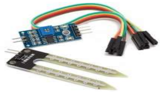
Fig. 8: Soil Moisture Sensor

This is an easy to use digital soil moisture sensor. Just insert the sensor in the soil and it can measure moisture or water level content in it. It gives a digital output of 5V when moisture level is high and 0V when the moisture level is low in the soil.