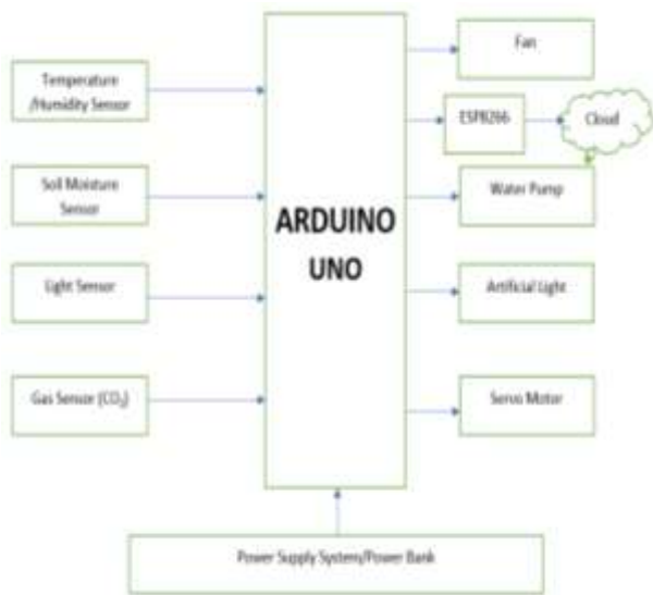
Fig. 2. Architecture of the proposed system