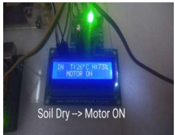
Fig.13: shows motor ON condition when soil dry