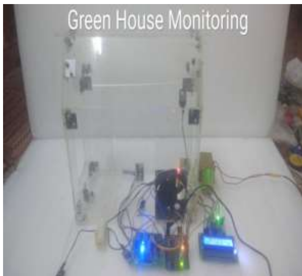
Fig.10: Green House monitoring Experimental setup