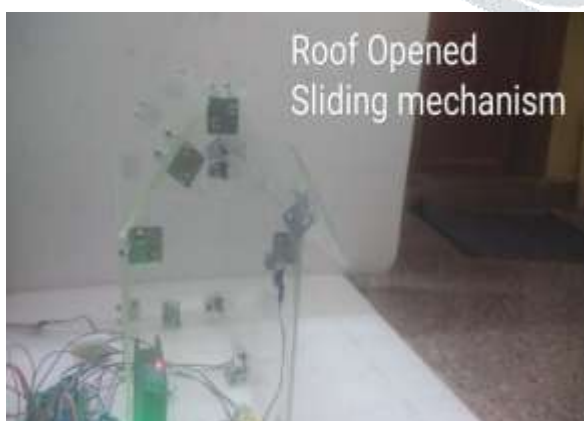
Fig.12: shows roof opened in setup