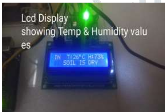
Fig.11: Temperature and humidity values displayed on LCD when setup working condition