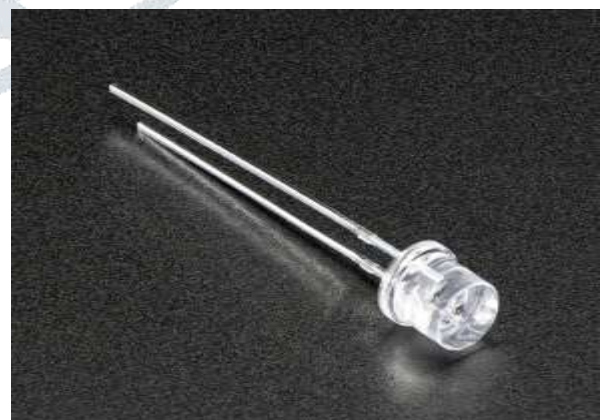
Fig 5. Light Sensor