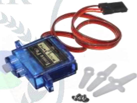
Fig.9: Servo Motor

Servo motors are used to control the position of objects, rotate objects, move legs, arms or hands of robots, move sensors etc. with high precision. Servo motors are small in size, and because they have built-in circuitry to control their movement, they can be connected directly to an Arduino.