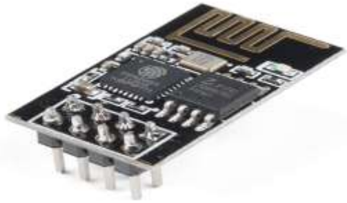
Fig.6. Wi-Fi ESP8266

The ESP8266 WiFi Module is a self contained SOC with integrated TCP/IP protocol stack that can give any microcontroller access to your WiFi network. The ESP8266 is capable of either hosting an application or offloading all Wi-Fi networking functions from another application processor. Each ESP8266 module comes pre-programmed with an AT command set firmware, meaning, you can simply hook this up to your Arduino device and get about as much WiFi-ability as a WiFi Shield offers (and that's just out of the box)! The ESP8266 module is an extremely cost effective board with a huge, and ever growing, community.