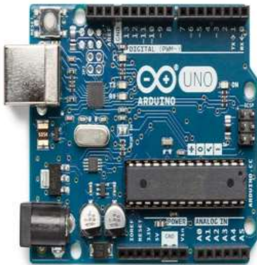
Fig.3 Arduino Micro Controller

A Light Sensor is something that a robot can use to detect the current ambient light level - i.e. how bright/dark it is. There are a range of different types of light sensors, including 'Photo resistors', 'Photodiodes', and 'Phototransistors'.