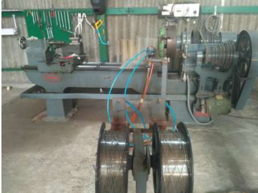
Figure 6.1 : Layout of Two wire electric arc spraying