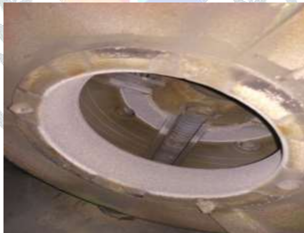
Figure 6.2 : Material coated bush on lathe