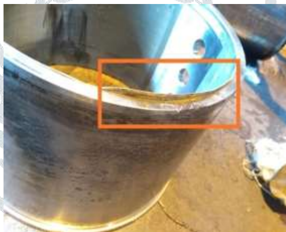
Figure 3.1 : wear out of the babbitt material