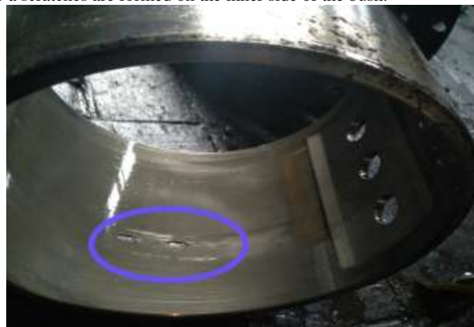
Figure 3.2: Scratches on inner side of the bush

The scratches are formed on inner side of the bush while performing the operations. The sleeve neck is wear out while friction takes place in between the sleeve and lock nut. The sleeve neck metal is wear out in the form of small discontinuous chips. These chips are entered into the inner side of the bush through the lubricants. If the chips are enter into the inside of the bush, the inner side of the bush is a soft metal so a scratches are formed on the inner side of the bush.