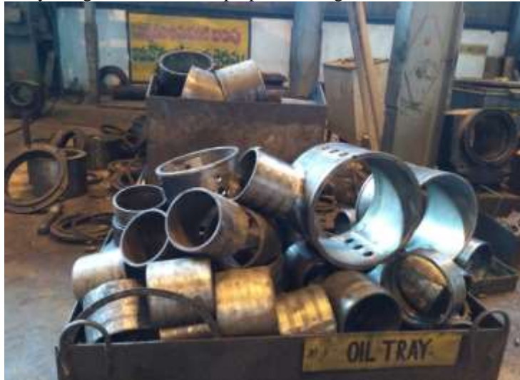
Figure 3.3 : Bushes at scrap area

While assembly, the bush is inserted in a chock bore by worker. If the bush is not positioned exactly in the chock bore ,the worker is hammering on it. This causes the damage of the babbit layer. Do not rotate the bush inside the chock bore. Before assembly the parts should cleaned by using oil and maintain proper handling to reduce the failures of the parts.