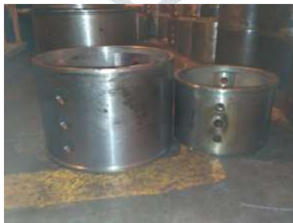
Figure 1.1 : Bush