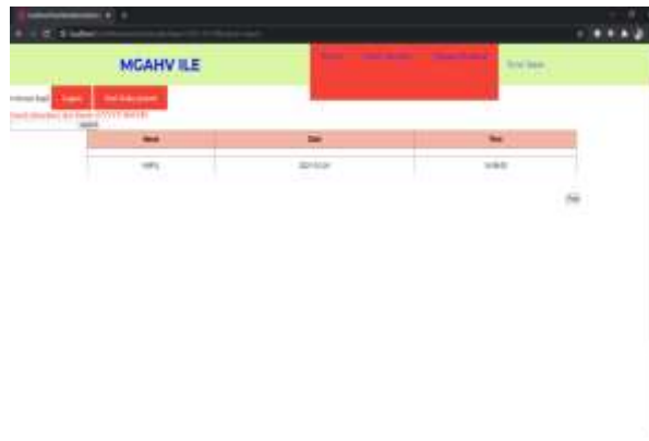
Fig 5.2: Online Webpage Display record