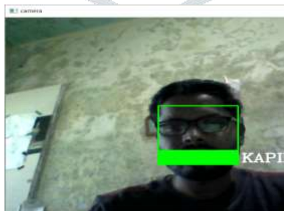
Fig 5.1: Web Camera Detection

In online projects we use HTML, JavaScript, PHP In which it has possible to started a new session, show, edit and change the records.