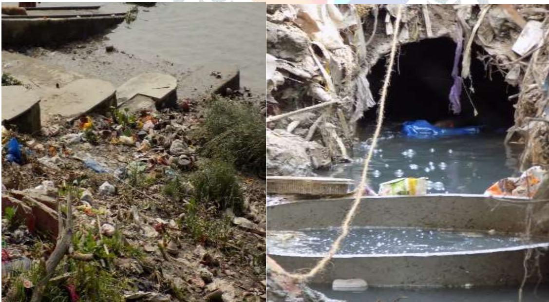
Fig: Present status of garbage dumping and water pollution at Gaurang Ghat & Mahotsavtala

Radhapada Das, an ISKCON Devotee at Panihati emotionally expressed that, embracing all people equally was a revolutionary movement by Caitanya Mahaprabhu. He started from this place Chira Mahotsav to bring all caste creed people together at one place, this makes the place of high spiritual value and this needs to be maintained. He continued to show the place at Gauranga Ghat where lotus feet of Chaitanya Mahaprabhu touched the ghat and says that Lord Chaitanya eternally resides here. Showing the garbage all over at the same place he was tearful. Open drains being released in Ganges, erosion of river banks, encroachments on river land and construction of buildings by deforestation he explained how these situations have loosened the soil to an extent that there is a pressure on land which may cause devastations in near future by floods. Also lack of solid waste management and the pollution of place by the garbage and open drain releasing in Ganges next to the temple is affecting seriously the sentiments of the local people.