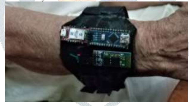
Figure: - IOT Wearable Health Band

Internet of Medical Things (IoMT) is becoming a common paradigm with so many advancements in the medical industry. This has increased the life expectancy of people especially in the developed countries [10]. The Internet of Health Things [11] or Internet of Medical Things [12] or Smart Healthcare [13] as it being called is combining the reliability and safety of conventional medical devices used for the treatment of chronic illnesses with the dynamicity and generality of Internet of Things. IoMT is providing solutions for addressing the requirements of both the ageing population as well as patients with chronic diseases and providing patients mobility in contrast to the telemedicine systems.