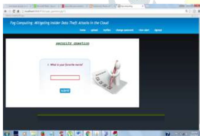
Fig 9: Security Question Page