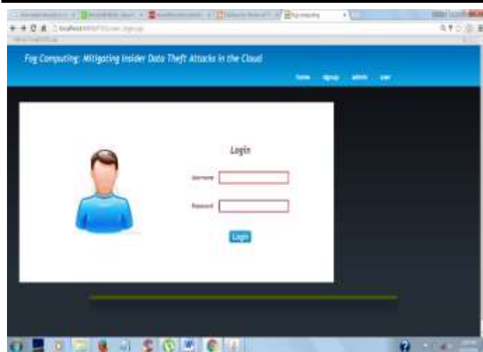
Fig7: User Login Page