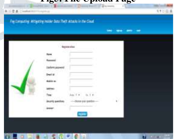
Fig6: User Sign Up Page