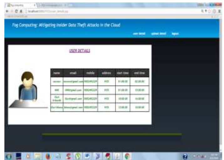
Fig4: User Details page