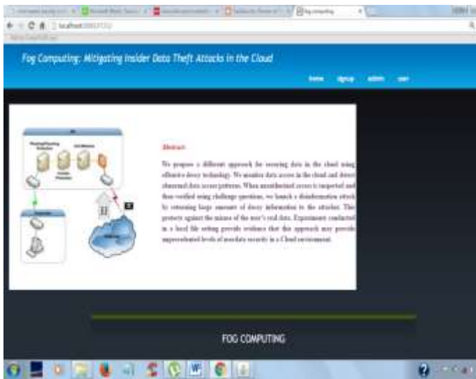
Fig1: Home Page