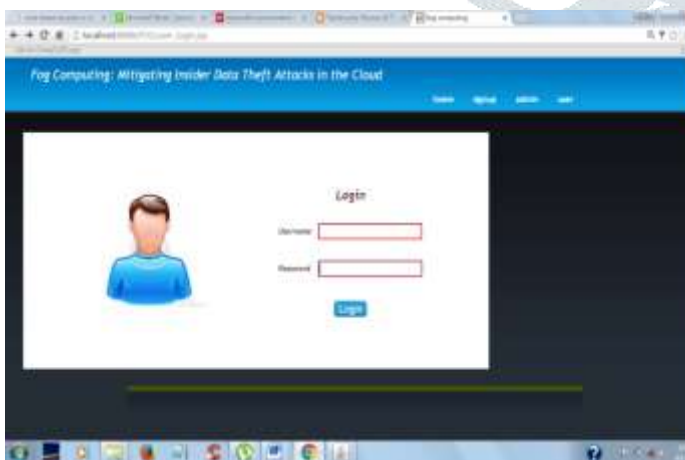
Fig3: User Login Page