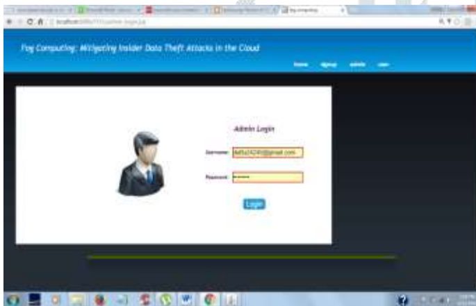
Fig2: Admin Login Page