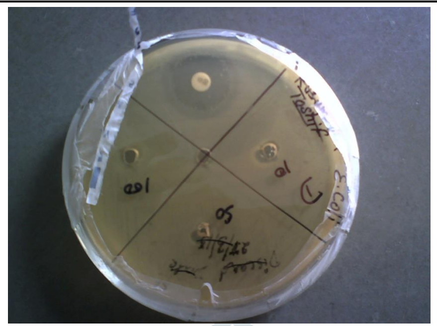
Figure-01:-Photograph showing effect of compound-1on Bacillus subtilis