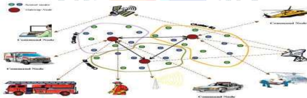
Figure 1.1: Wireless Sensor Network

Wireless Sensor Networks (WSNs) is an indispensable part of our life due to its monitoring and security aspects. Wide range of applications makes its significant for us. WSN consists of a number of sensor devices that work together with each other to accomplish a common task (e.g. environment monitoring, object tracking, etc.) and report the collected data through wireless interface to a center node (sink node). The areas of applications of WSNs vary from civil, military, environmental to healthcare. Examples of applications include target tracking in battlefields, civil structure monitoring, forest fire detection, habitat monitoring, and factory maintenance [1].