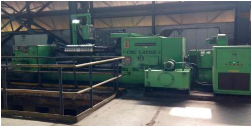
Fig.1: CNC Turning Machine.