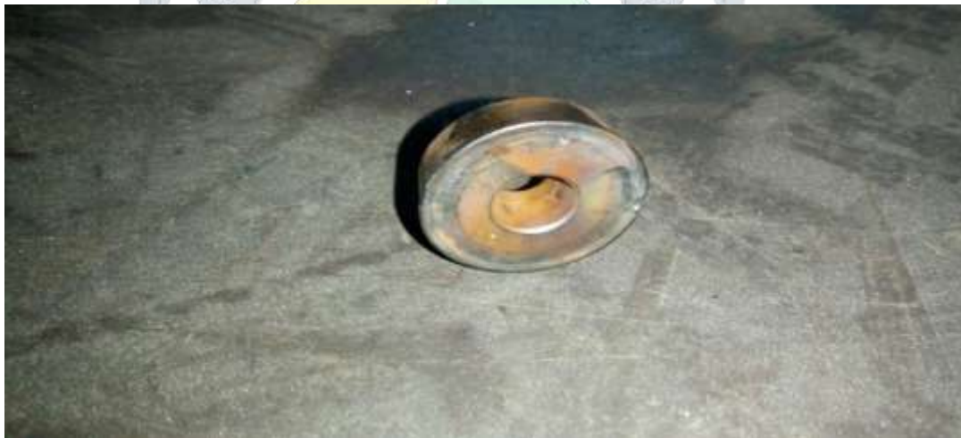
Fig.2: Cutting Tool Insert.