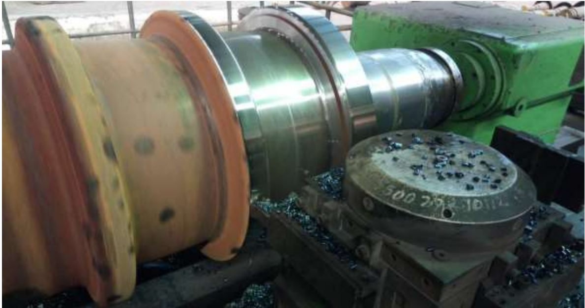
Fig.3: Experimental Setup.