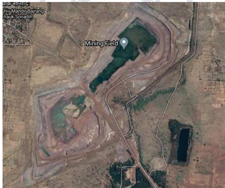
FIG.3 SINK-HOLES AS OBSERVED THROUGH GOGGLE