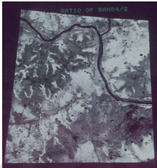
FIG.2 PALEO-DRAINAGE AS OBSERVED THROUGH BAND RATIO 4/2