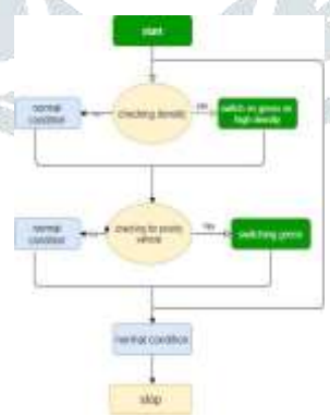
Figure 2 Flowchart of a RFID based traffic management system

As previously mentioned in [6]. The RFID transmitter and receiver module in the Smart traffic signal system transmits and processes the data obtained in real time. Rfid technology is easy and effective; it collects information from the transmitter (Rfid tag) and receiver modules such as traffic density, vehicle number, vehicle priority (for emergency vehicles), and vehicle type (2 or 4 wheeler), all of which can be handled by a processor such as the Raspberry Pi. When traffic density exceeds the regular cap, the system chooses to provide overtime to the lane with the most traffic; the system has four sets of signals in operation. Each lane follows the same signal pattern, which begins with a green signal, then a yellow signal, and finally a red signal to stop, before repeating the process. The traffic scheme starts with a green signal in lane 1 and finishes with a red signal in the remaining lanes. The green signal moves from each lane until it reaches the last lane, following the sequential pattern. If the lane moves, the timer resets. The RFID-based traffic model is depicted in fig 2 as a flowchart. If there is a lot of traffic, the green signal stays on for an additional 10 seconds to clear the road. Every lane has an RFID reader that monitors the lane and scans priority vehicles RFID tags to identify them [7].