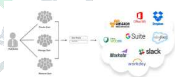
Figure 2: IAM Single sign on

We are going to discuss about the architecture and deployment models for identity access management for cloud services. This is a vast topic we are going to cover three different cloud service models SaaS, PaaS, and IaaS. We will talk in detail with three different deployment scenarios public, private, and hybrid. There are different communication protocols to address authentication, authorization, and provisioning. The cloud security has many different kinds of security standards which make it hard to choose from. It is hard to choose because it is not one size fit different company has different types of requirements. It requires work to determine which standard is good to solve a specific problem. Few cloud service providers even provide security standards which often incompatible with the company requirements. IAM is the starting point for companies to think about cloud identity. Security standards are much better driven by cases and risks. Our main objective is to establish an architecture that fulfils all the company requirements.