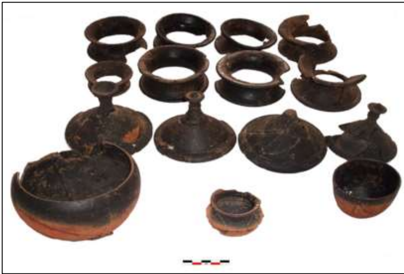
Figure 2. Rings stands, lids, pot, cup shaped vessel and bowl