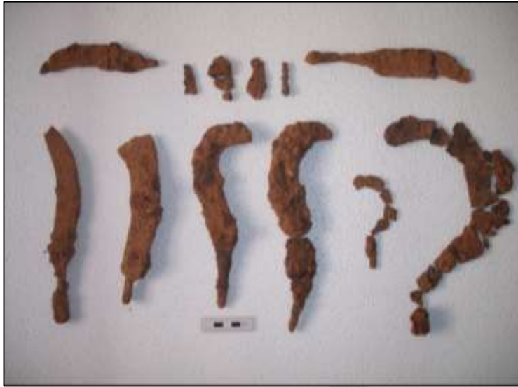
Figure 4. Iron artifacts collected from the cist burial