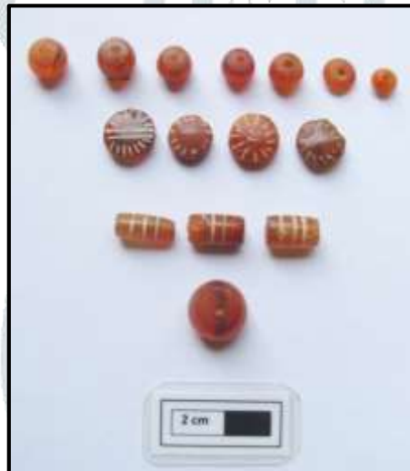
Figure 5. Carnelian Beads

Fifteen carnelian beads were collected from the excavation. Out of these 4 beads are etched (Decorated) tablet shaped, 3 are etched barrel shaped and 8 are unetched (without decoration) round and circular beads (Figure 5)