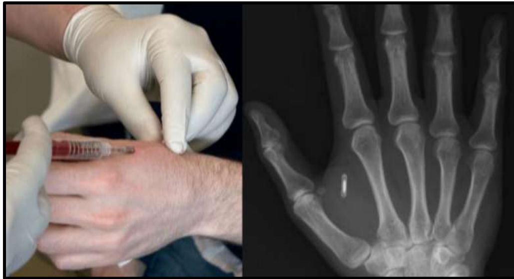
Fig. 3: RFID Implanting

are used. Again to repeat performing implanting process is highly dangerous unless it is not done under the strict observation of professionals. The following picture (Fig. 3) shows a clear idea of the RFID implanting process.