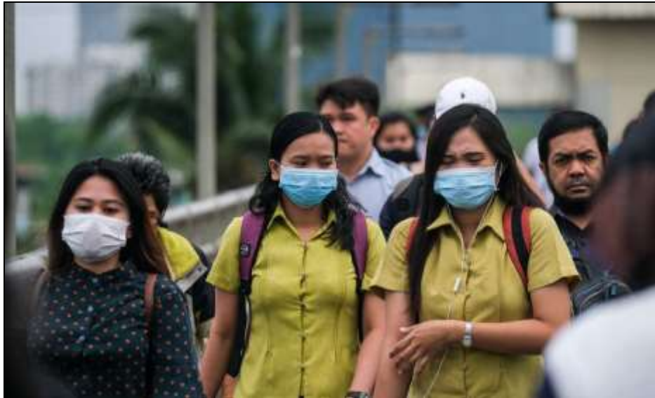
Figure 1. Represent the COVID 19 Pandemic Situation

their emotions from general public who try to watch their current activities. But now a day it is becoming very mandatory for each and every one to wear facemask to protect from spreading corona virus from one person to another. In 2020, we faced a lot of deaths due to corona virus and the world declared COVID 19 as international pandemic due to fast spreading of multiple covid deaths. This infection is increased over 6 million cases in not less than 10 days across 180 countries. This virus is mainly spread through close contact who is packed in certain crowded areas or inside a closed room through air. Hence the usage of face mask is becoming more and more mandate to prevent the fast spreading of this virus[1].