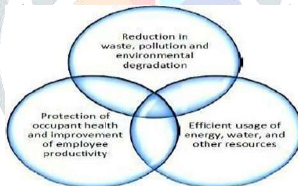
Fig-1: Parameters defining green building concept

As the population is increasing, more and more buildings are required to fulfil their needs, trashing more natural resources, and impacting the environment. Hence a new concept of eco-friendly building or 'Green Building' is emerging rapidly. Green building on college campuses is the purposeful construction of buildings on college campuses that decreases resource usage in both the building process and also the future use of the building. The goal is to reduce CO 2 emissions, energy use, and water use, while creating an atmosphere where students can be healthy and learn.