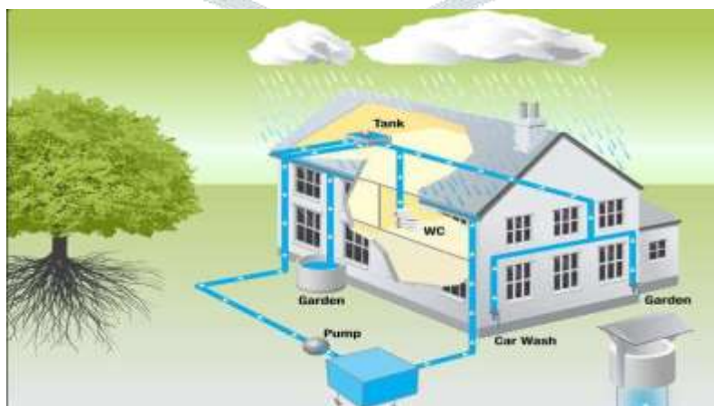
Fig no. 6 Representation of Rain Water Harvesting

Water shortage is caused by climate change, lack of planning of water uses, rapidly increasing water pollution and increasing population. So, under such conditions some serious steps towards conservation of water must be taken. Rain is a natural source of water. So, if it can be collected and treated, it can be used as portable water. It is a cheap and simple technology, so it can be easily installed in normal households and a lot of water can be saved.