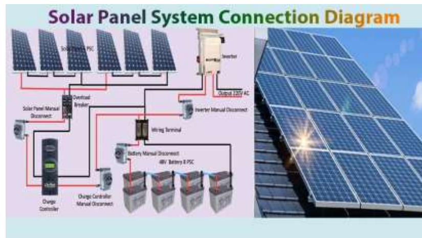
Fig: 5 Solar panel system connection

➤ If in place of Incandescent lamps, we use CFL lamps of 15 watts then we can save up to 205.065 KWh per month and in place of Fluorescent tubes if we use LED tubes of 18 watts then we can save up to 216.876 KWh per month. That is a total of about 422 KWh/month and around 10-12% of total energy consumed in the building