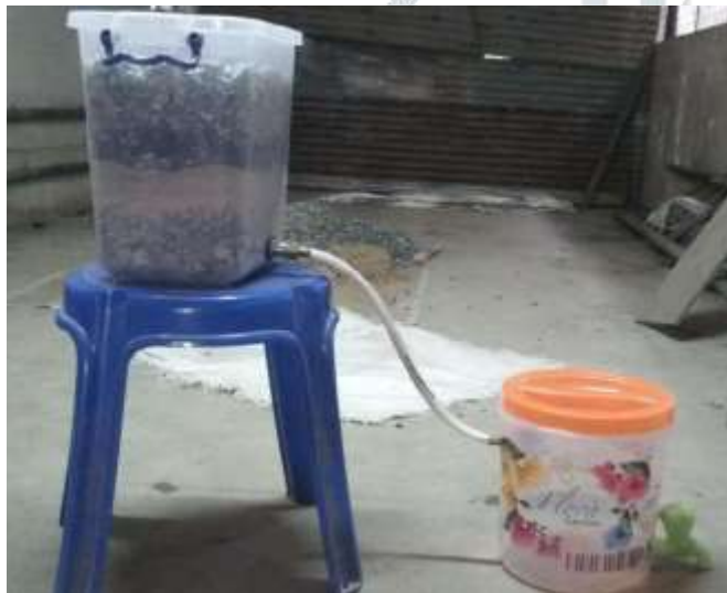
Fig 2: Grey Water Filter

Therefore, total depth of the tank = thickness of layers + 0.7 = 1.4 + 0.7 = 2.1m