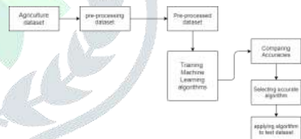
Fig-1 Architecture Diagram.

In our proposed system we are going to collect Crop dataset .Now we are going to pre process the dataset initially and then send each dataset individually first into RNN , LSTM and then into Feed Forward neural network algorithm. Based on the accuracy i.e.; the number of wrong predictions we select the best algorithm. In our project it is LSTM Algorithm is the most efficient algorithm. And then we apply this algorithm to test dataset.