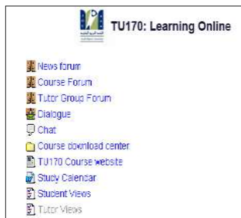
Figure 3. TU170 course (AOU) with its forums