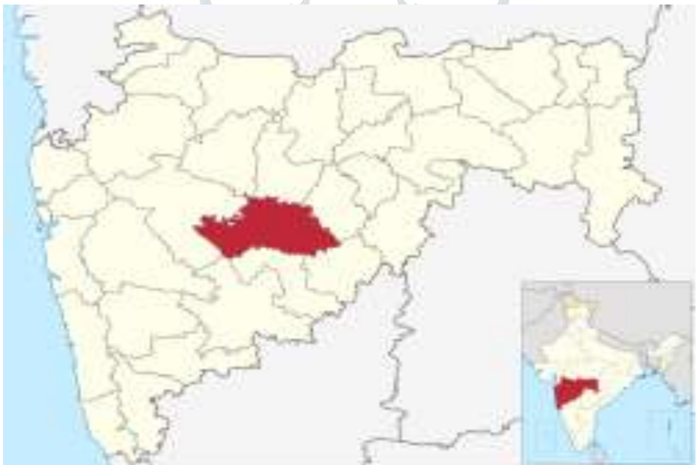
Beed District in Maharashtra

Details of Proposed Area:- Beed, Marathwada Region, Maharashtra.