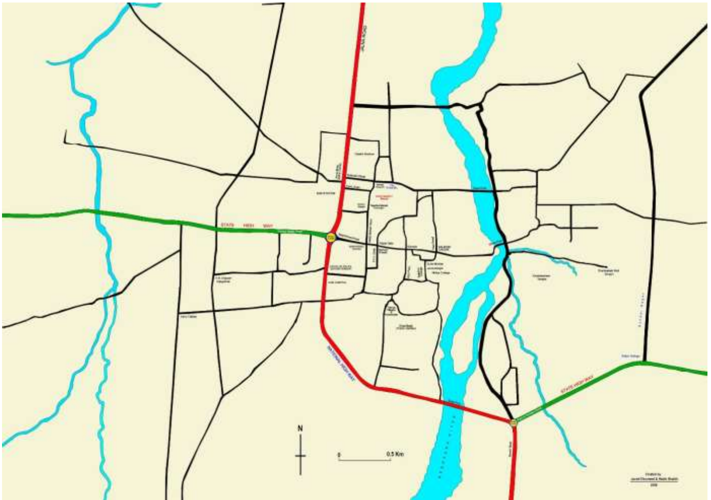
Beed City Water Plan

In the near future there will rise in population, the current water distribution system will not be able to fulfilled the water supply need in every household. Therefore they have to make changes in there water distribution system so that this problem are solved.